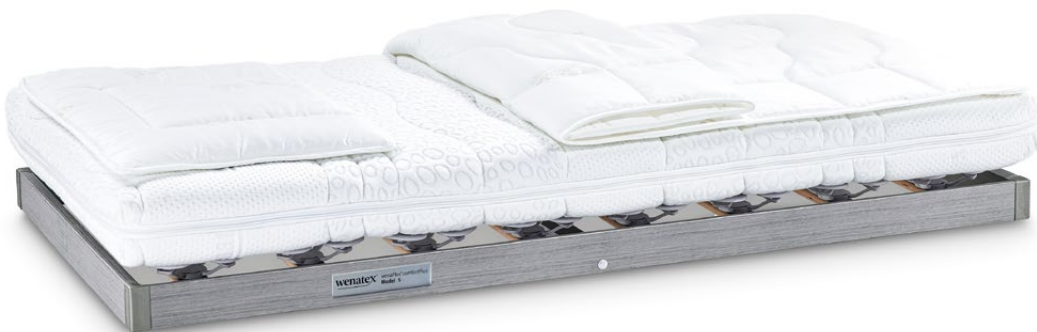
Symbol photo wenaCel® comfortPlus Orthopaedic Sleep System for babies and children

Restful and regenerative sleep is vitally important for the health of your child. This is why you should choose a mattress that perfectly meets a child's needs. Along with the child's favourite cuddly toy and cosy duvet, the wenaCel® comfortPlus Orthopaedic Mattress is the ideal companion through the night.